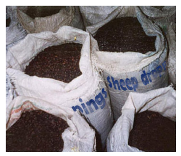
When dry, the droppings were then put in sacks by trained 'Poo Packers' ready for distribution to the waiting public.