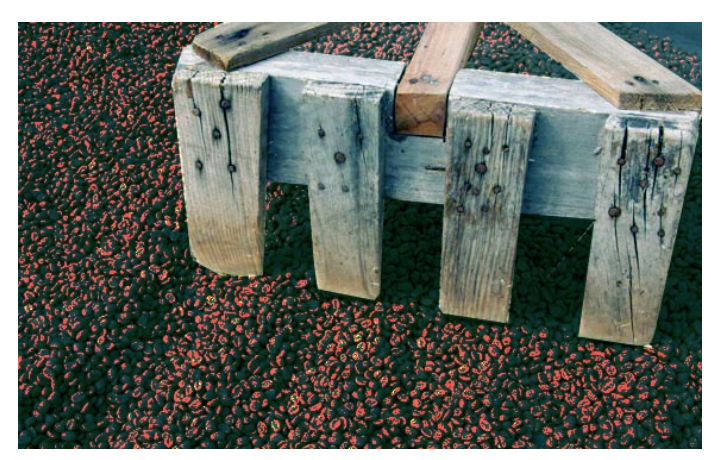
The droppings were frequently 'turned' using a cheap old wooden rake.