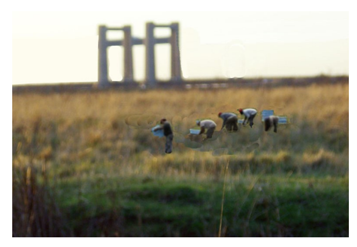
In olden days groups of people could be seen collecting thousands of sheep droppings in the early evening...backbreaking work!