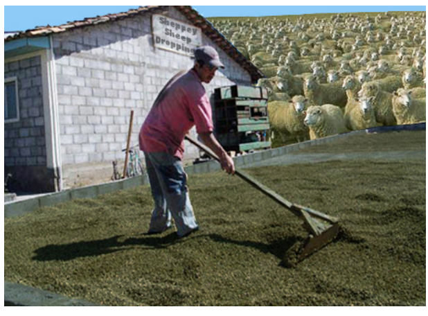
Sheep droppings were collected and air dried as soon as a sunny day occurred on Sheppey.