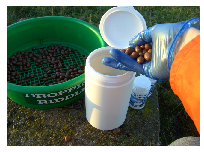
A specialised 'Dropping Riddle' was used to sieve out the larger droppings. This expensive piece of equipment is similar in size, colour & construction to a standard plastic garden riddle found in Aldi.