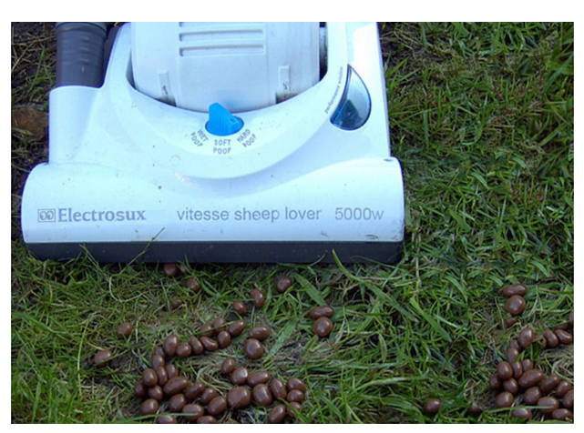
Mechanical methods were introduced to speed up the picking process.