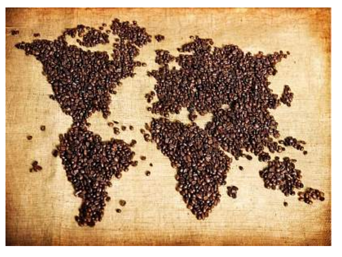
According to the man in the pub, sheep droppings were sent all over the world. However, we do not know how many people ate them ...or if anyone ever ate them at all!