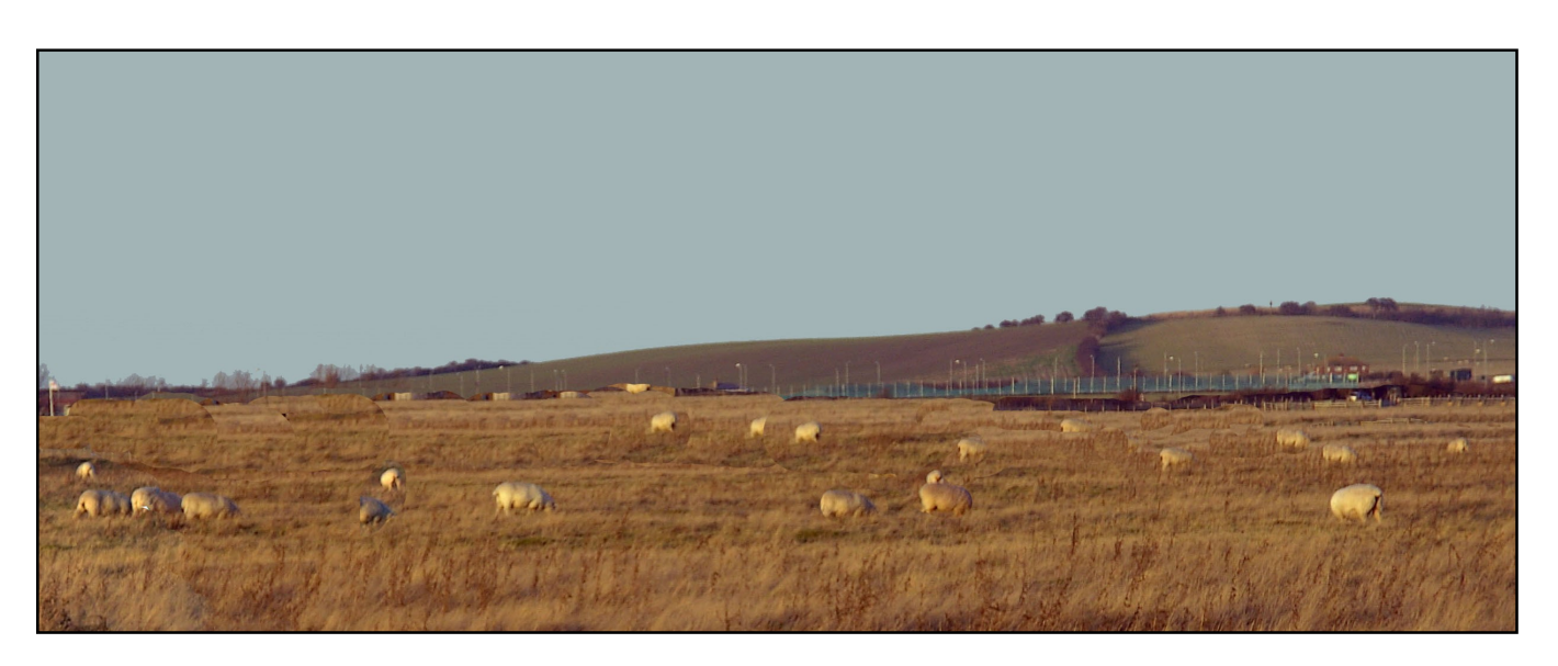
The Isle of Sheppey has lots of sheep and apparently, many years ago, the main reason for breeding them was not for their wool or meat, but for the small brown spheroid droppings that would fall from the backend of these amazing creatures. Millions of these would decorate the moist grasslands of Sheppey.